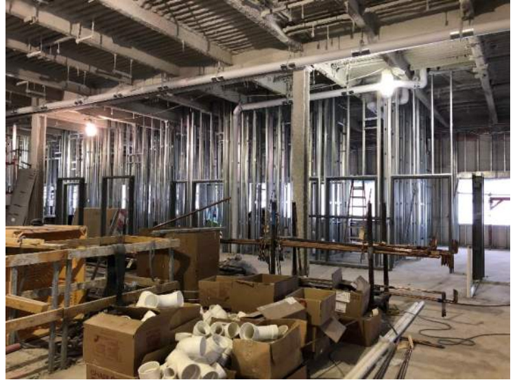
Another view of the upper level Clinic / Med Surge addition. As the stud framing moves around the upper level, a lot of coordination must also occur to move around / store materials.