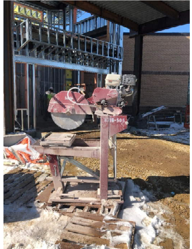
The masons use a wet saw, pictured above, to cut bricks or blocks within the field. This saw was specifically used for the headstone pieces that line the east end of the building.