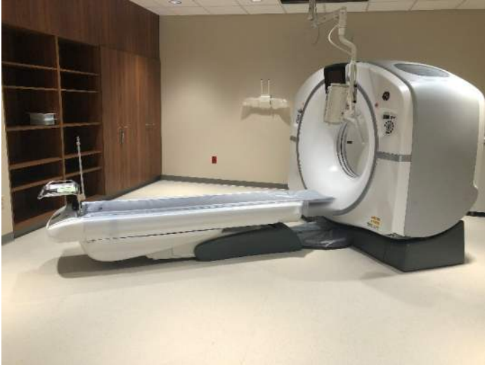
A view into the new CT room, which is nearly complete. A few ceiling tiles remain to be popped back into place before the grand opening.