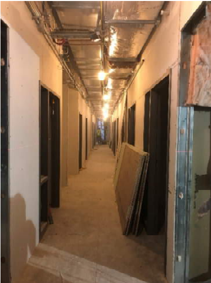
A view down one of the long corridors in the lower level Clinic / Med Surge addition. The drywall installation is nearly complete.