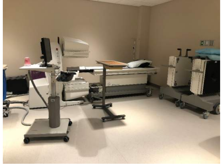
The Nuclear Medicine equipment was relocated from the existing room to its new residence here.