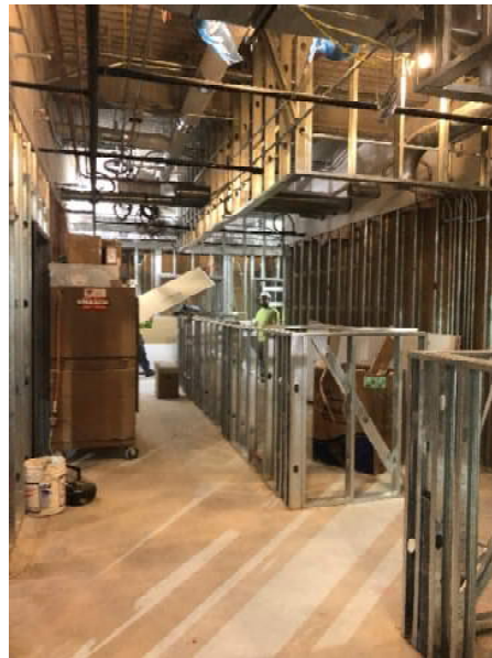
The stud framing for the lower level Clinic / Med Surge addition nurse stations are complete and the next step is installing the drywall.