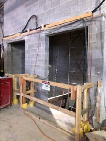
The elevator cards have begun installation, the first step is measuring out the masonry shaft and adjust any imperfections.