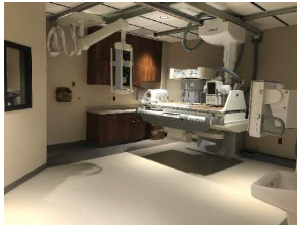
The brand new Fluoro machine has finished being installed and is ready for the grand opening.