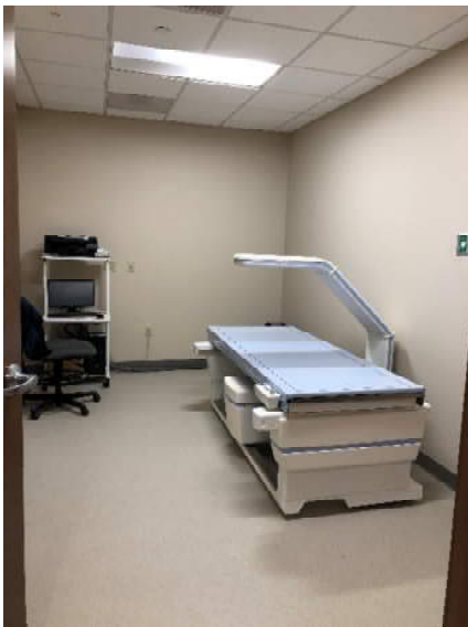
This is a view into the new Bone Density room within the Imaging Suite.