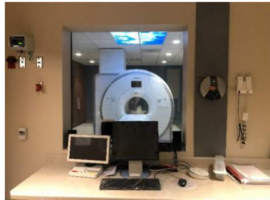
The MRI was moved into place through an exterior window and a crane using counter weights as shown in the photo on the left. The MRI now sits in its final room which is nearly ready for use! The photo on the right is the view of the machine from the control room.