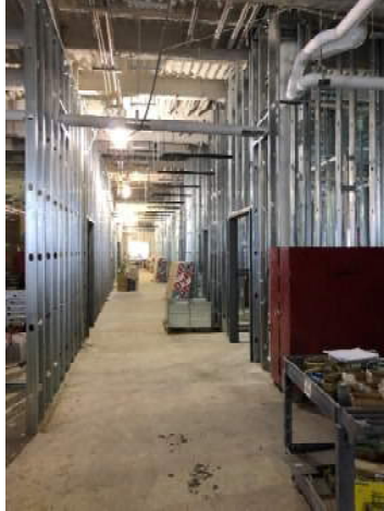
This is a view down the stud walls being installed in the upper level Clinic / Med Surge addition.