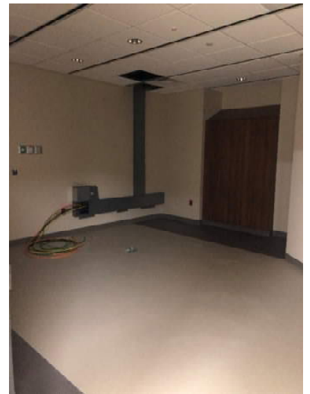
This is where the existing X-Ray machine will be relocated to before the Imaging Suite is opened up.